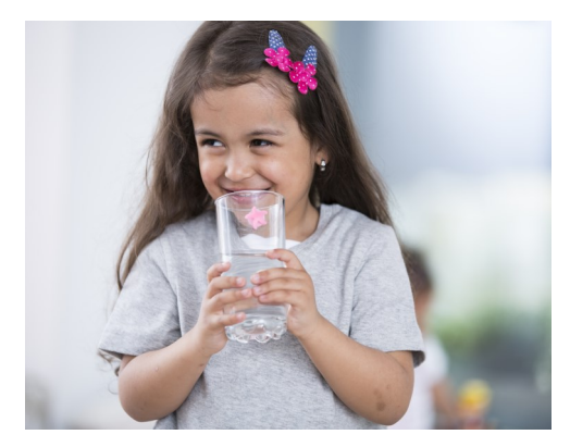
What's in your water? Our latest surveillance brief takes on private well water quality.

In case you missed it, we released our <u>2017 County Environmental Health Profiles</u> in May. The profiles are a snapshot of the data we have available on our portal. <u>Download yours today!</u> The profiles will be updated again in 2019.