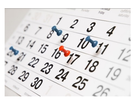
STOP BY AND SEE US SOMETIME

Stormy weather becomes more frequent during late spring and early summer. Take the opportunity now to review the Building Resilience Against Climate Effects (BRACE) <u>Wisconsin Severe Thunderstorms and</u> <u>Tornadoes Toolkit</u>.