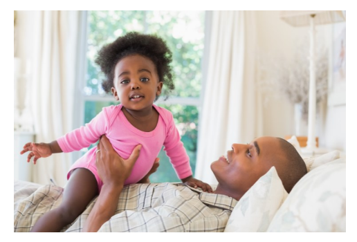
Kids should be happy, healthy, and lead-free!

A <u>new report</u> on the status of Wisconsin childhood lead poisoning was released in January 2016. The report, issued from the Wisconsin Childhood Lead Poisoning Prevention Program (WCLPPP), contains details on issues related to lead poisoning, activities of WCLPPP, trends in lead testing and poisoning in Wisconsin, and efforts to prevent poisoning.