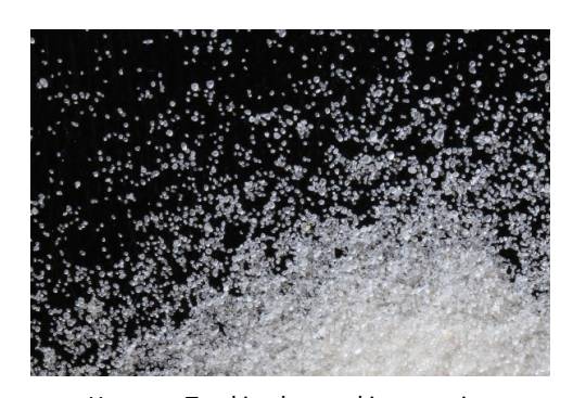
How can Tracking be used in assessing health outcomes?