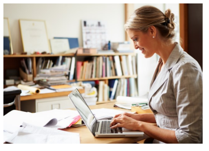
JOIN THE CONVERSATION

Have questions about Tracking? Unsure how to use your data? Want to share a success story? Got feedback? We want to hear from you!