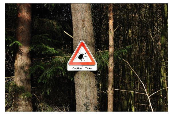
Our most recent brief explores Lyme disease in Wisconsin. Have an idea for a future brief? Let's talk!

Environmental health is a complicated topic. How can we do better to explain what environmental health is and why the work we do is important? <u>The Frameworks Institute</u> has extensively studied this question and put together several helpful resources, including <u>Building Understanding</u> of Environmental Health: A Communications Toolkit.